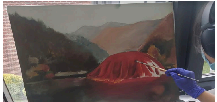
A Level Artwork

This week is International Week and classes and mentor groups across the school are investigating issues and cultural aspects in different countries around the world. In a normal year, this week would come to a fantastic finale with our International Evening. Unfortunately, this year we are unable to host this event at this time; however, we do hope that we may be able to run the evening later in the school year. On Friday of this week, we invite all students to come to school in national costume to celebrate the day.