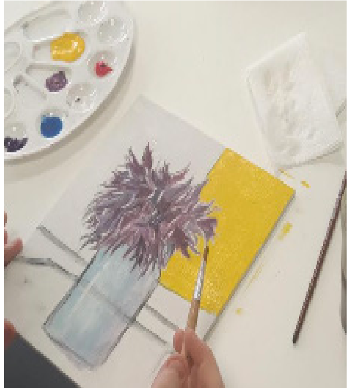
A level Artwork

We have new stocks of school uniform shirts available. They cost 40 GEL half/full sleeve with a badge. BIST hoodies are also available for 55 GEL. Contact Ms. Tamuna via email if you would like to purchase.